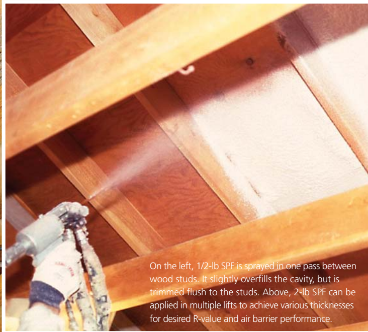
On the left, 1/2-lb SPF is sprayed in one pass between wood studs. It slightly overfills the cavity, but is trimmed flush to the studs. Above, 2-lb SPF can be applied in multiple lifts to achieve various thicknesses for desired R-value and air barrier performance.

The first point is quite easily answered, but the second requires a more detailed analysis of the specific building's use, construction type, environment, and other general characteristics.