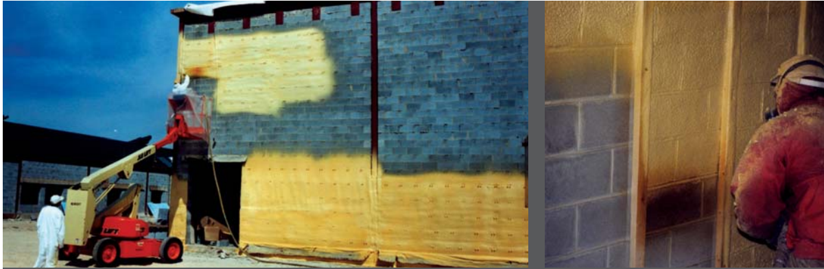
In the above curtain wall (CW) construction, 2-lb SPF is used to insulate the exterior of a building, helping to eliminate thermal bridging, while adding a secondary barrier against water penetration to the inside of the building. On the right, 2-lb SPF is used to achieve high R-value in a limited space.